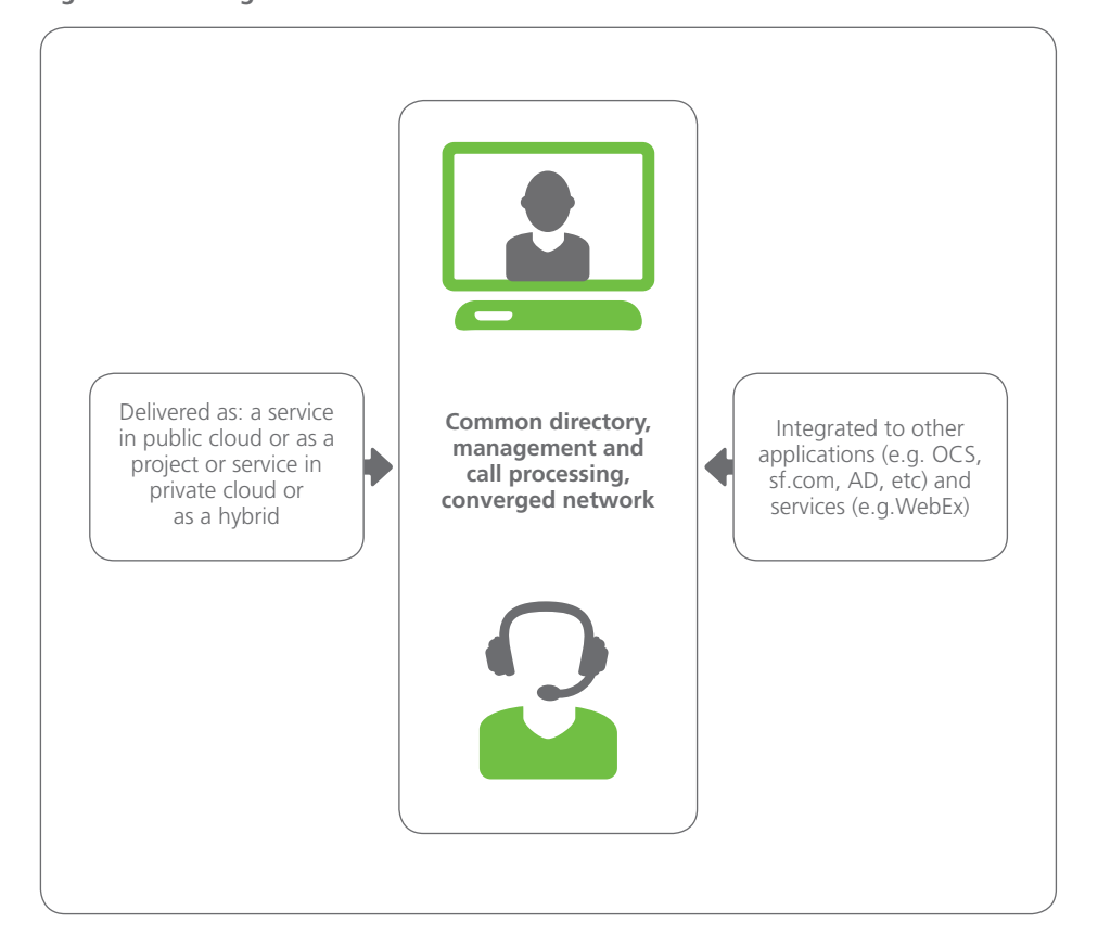
Figure 3: Convergence of Voice and Video

The other point to note in the image above is that consumption models will change and organisations will have more flexibility in terms of how they buy. Today's predominant model of capital expenditure on infrastructure will be supplemented with utility pricing models, delivery out of a public cloud and hybrid scenarios.